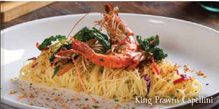
King Prawns Capellini

Tender, juicy & flavourful slow-roasted marinated lamb shoulder. Served with garlic spiced rice & sautéed chef's vegetables.