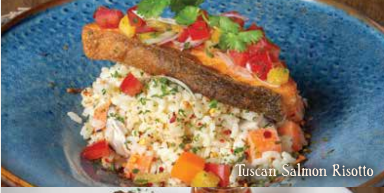
Tuscan Salmon Risotto