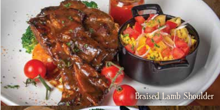
Braised Lamb Shoulder