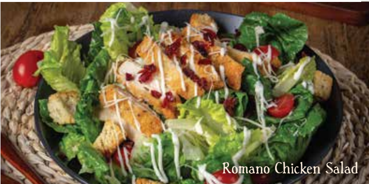
Romano Chicken Salad