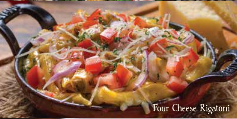
Four Cheese Rigatoni