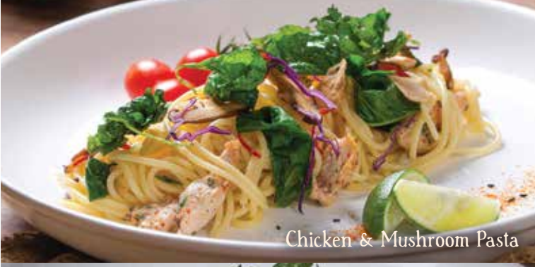
Chicken & Mushroom Pasta