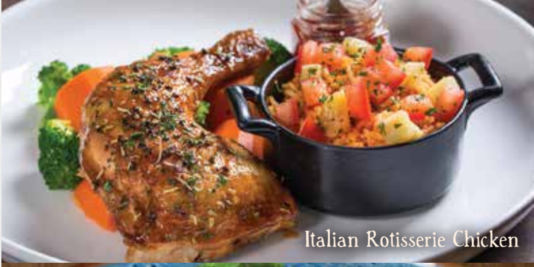
Italian Rotisserie Chicken