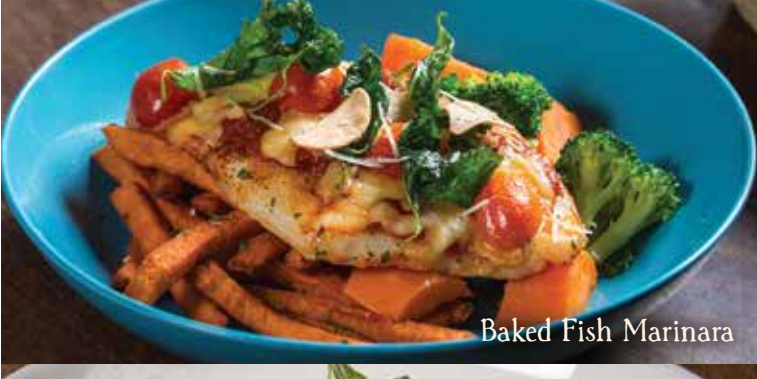
Baked Fish Marinara